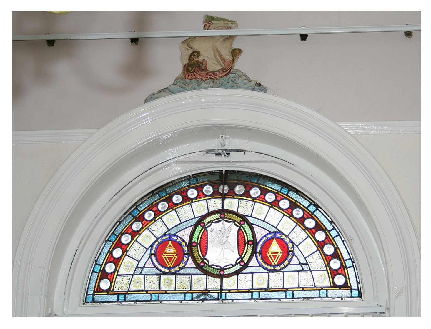
Saint John's of Jerusalem Chapter 203 Bicentenary Convocation Liverpool Masonic Hall - Saturday 14 September 2024

Wednesday 28 July 1824 was a significant day in Liverpool Royal Arch Masonry as companions gathered at Liverpool Masonic Hall to attend the consercration convocation of Saint John's of Jerusalem Chapter No 203.