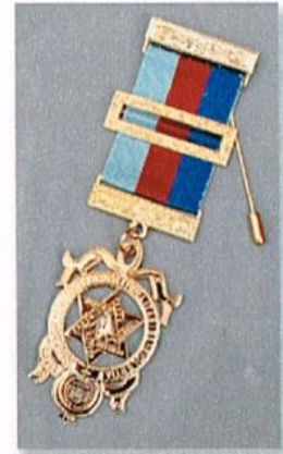
Provincial or Grand Officer

In addition, there are the Royal Arch Contacts in Lodges who hold special liaison roles to advise prospective Exaltees.